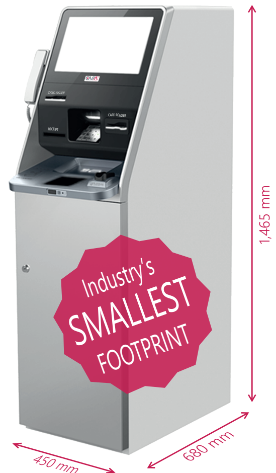
*iTM61 (front service)-Lobby